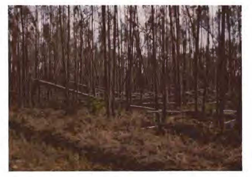
Figure 1. Heavily damaged pine stand in Hancock County showing parallel but opposite direction alignment of fallen trees. Note direction in which standing trees are leaning.